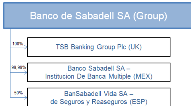
Chart 3: Main subsidiaries and investments of Sabadell

The main subsidiaries and investments of Sabadell can be found in the following chart: